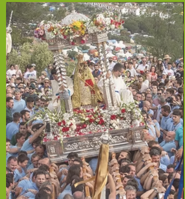
Virgen de la Cabeza

Historic center declared of cultural interest