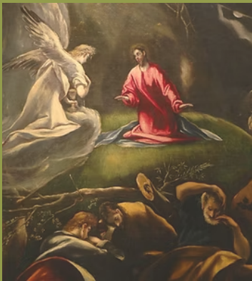
La Oración del Huerto El Greco